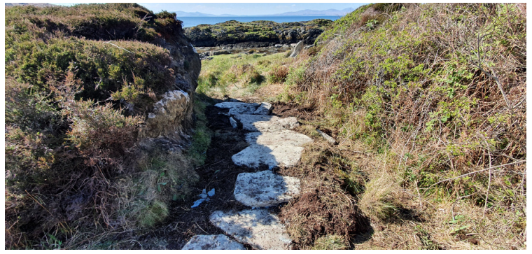
A formerly muddy gully en route to Fisherman's Cave

Archaeology Scotland will be visiting on 1st to 3rd of July with the aim of involving community members in the conservation of Kilchattan graveyard. We also have a stone conservator coming in June to 'clean' the Ogham Stone ahead of a summer visit by staff of Glasgow University Celtic Studies department to survey and scan, for 3-D modelling, this precious representative of island's rich heritage. There will be a workshop for community members on this fascinating technique.