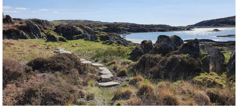
En route to Fisherman's Cave